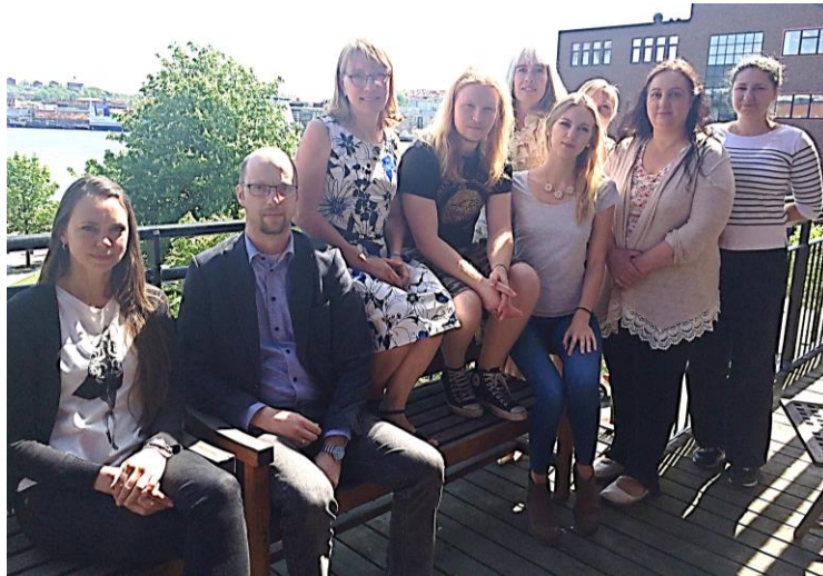
Fig. 4 National DOMB Network Meeting, Lindholmen Campus